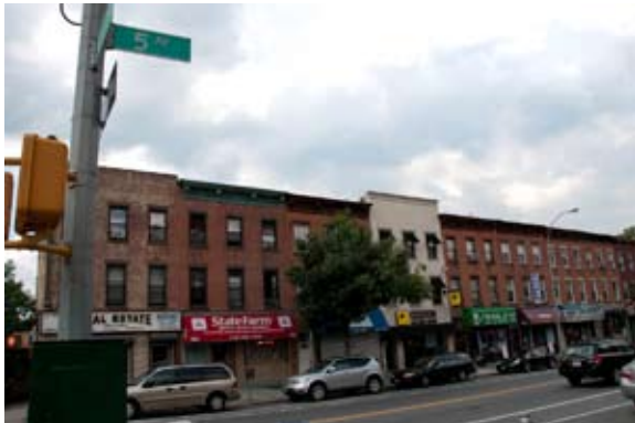
Corner of 22nd Street and 5th Avenue.