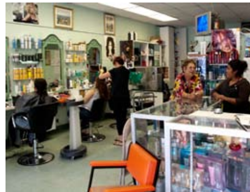
Spacious and clean hair salon for all your hair care needs.