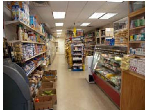
Excellent store for all your basic food needs.