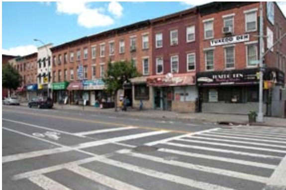
Corner of 21st Street and 5th Avenue.