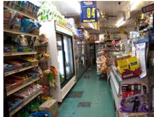
Open late, this store is a great stop to get something quick to eat or drink.